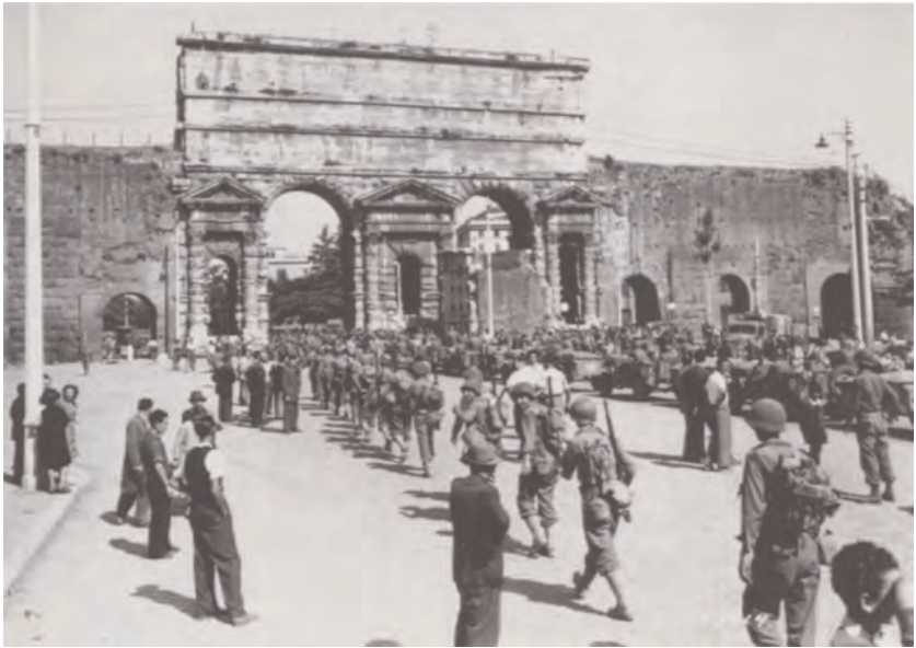
Troops of the 85th Division enter the gates of Rome.

way 6, the main German supply line, under fire at Valmontone. To General Truscott this was the turning point in the Allied drive to the north. Kesselring was furious with Mackensen for allowing the ridgeline to fall and ordered it retaken at all costs. But all of the German counterattacks failed, and when Valmontone became untenable because of American artillery fire, Mackensen was relieved of command and replaced by Lt. Gen. Joachim Lemelsen.