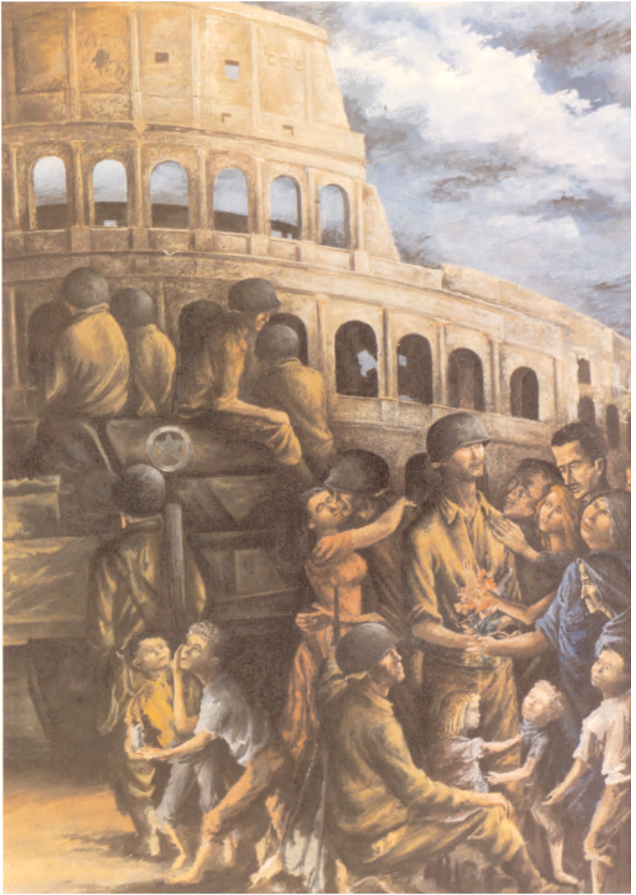
“Roman Holiday” by Mitchell Siporin. (Army Art Collection)