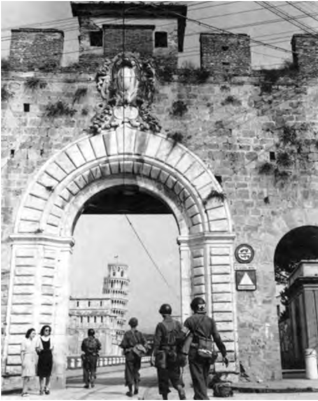
American patrols entering Pisa.