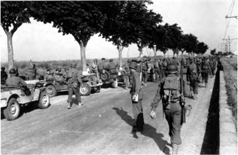
American infantrymen advancing along Highway 6 toward Rome.

thereby diverting German attention from II Corps movements, Clark sent the 88th and 85th Divisions racing toward Terracina. Between 23–25 May the Allied armies pushed the Germans back along the entire front. But while the FEC and II Corps pierced the Hitler Line in several places, the Eighth Army advance up the Liri valley slowed due to stubborn enemy resistance, difficult terrain, exhaustion, and heavy casualties.