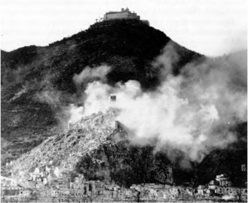
Cassino: the monastery, the castle, and the town.

posed at Anzio. During the following weeks the combined Anglo-American corps established a 15-by-22-mile beachhead, forcing the Germans to divert the Fourteenth Army under General Eberhard von Mackensen from northern Italy to the south. Other German units had to be dispatched to Italy, weakening enemy forces in Germany, France, and the Balkans. Yet the VI Corps commander, Maj. Gen. John P. Lucas, in a controversial interpretation of Alexander's and Clark's orders, directed the invasion forces to dig in before launching an offensive. His intention was to ensure the survival of the beachhead against a probable enemy counterattack, but the effect was to delay a breakout effort until 30 January. By that date the Germans had massed 70,000 troops around Anzio, and they effectively halted the Allied offensive with heavy losses on both sides. While subsequent enemy counterattacks failed to destroy the beachhead, which eventually contained 110,000 soldiers, the planned rapid advance on Rome had been stalled.