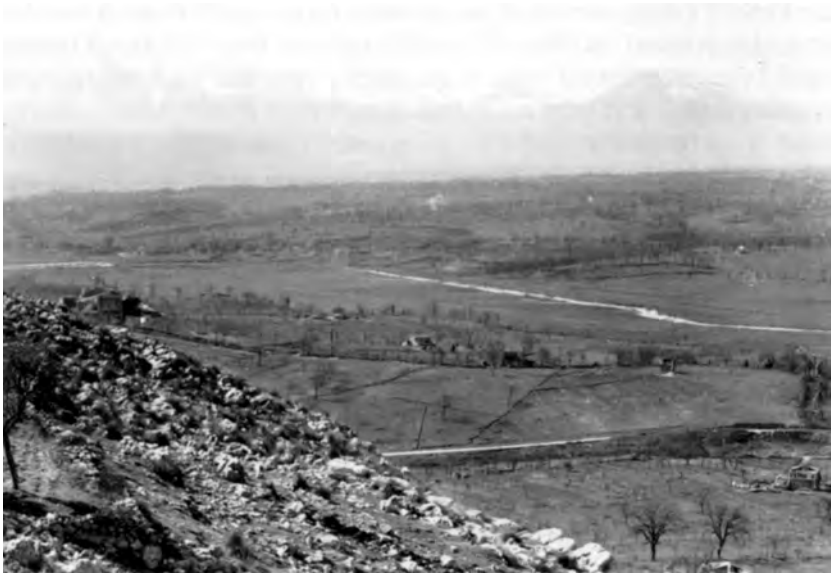
The Rapido River viewed from Monte Trocchio.

failed to expel the Germans from the heights on both sides of the Liri valley between 12–20 January, the entire area was under enemy observation. The 141st and 143d Infantry regiments of the 36th Division were to cross the river on the night of 20 January and envelop Sant’Angelo from the north and south. Both the division commander, General Walker, and the II Corps commander, Maj. Gen. Geoffrey T. Keyes, feared heavy losses. The assaulting units were below strength and contained many unassimilated recruits and inexperienced small unit leaders who had only recently arrived to fill the gaps left by the heavy losses suffered in earlier battles. Additionally, the troops lacked sufficient boats, bridging equipment, and training in river crossings. The engineers assigned to assist the crossings had obtained over a hundred rubber and wooden assault boats, but were unable to move them to the river bank because of withering enemy fire, poor roads, land mines, and spongy ground. They left the craft several miles to the rear near Monte Trocchio for the already heavily laden infantrymen to carry to the river on the night of the attack.